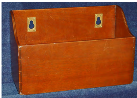
Figure 1. The "Hopper."

Tally Clerks. ⑥ ⑦ Another member of the Clerk's staff, the tally clerk, is usually seated to the left of the Clerk's lectern. The tally clerk operates the electronic voting system, oversees the recording of votes on the House floor, receives reports of committees, and assigns report numbers (e.g. H. Rept. 112-123). The tally clerk also prepares the Calendars of the United States House of Representatives and History of Legislation. In addition to the "seated tally clerk," during the operation of the electronic voting system a "standing tally clerk" stands on the lowest level of the rostrum and collects votes cast via