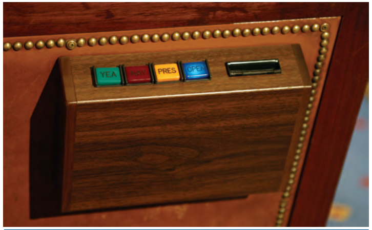
Figure 2. Input terminal for the electronic voting system.

Documentarian Pages. ⑬ The Documentarian Pages are the two pages who tend to the needs of the presiding officer and the chamber in general. The Documentarian Pages operate the controls for the House "bell system" which indicate the activity on the House floor and the elapsed time during an electronic vote.