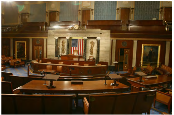
Figure 4. View of the Republican committee table (left) and Republican leadership table (right) from the back of the House chamber.

Committee Staff. When the House is considering a bill, staff from the primary and additional committees of jurisdiction are on the floor. Their job is twofold: first, they assist the Republican bill manager with allocating debate time and participation in debate, and second, they have a greater degree of understanding of the substance of the bill under consideration, and can often answer Member questions regarding the bill.